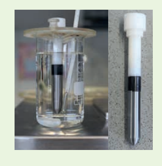
Specimen with additive

This was confirmed by the following test. Two steel rods were immersed in a solution of diesel fuel (90%) and water (10%) for a period of 24 hours at 60°C. Then the corrosion on the steel rods was evaluated visually. Corrosion started in the specimen without additive after only 2 hours. The specimen with additive withstood the test without any corrosion whatsoever.